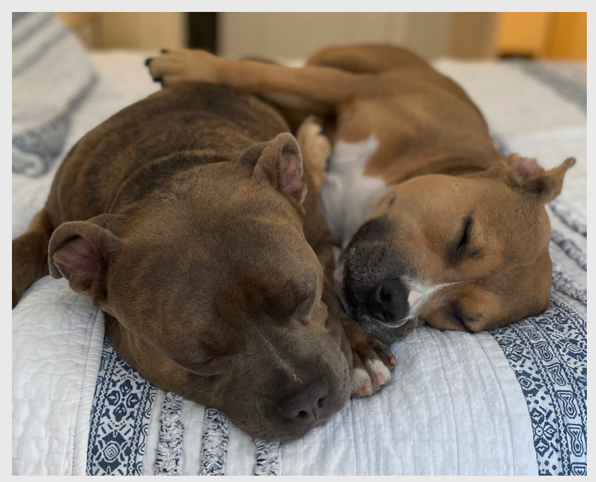
Yogi, adopted September 2020, and Ruth, adopted June 2018