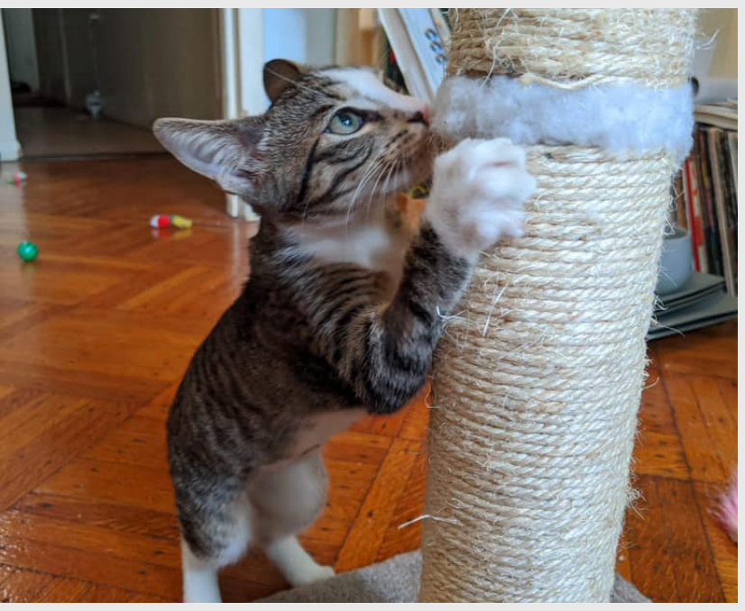
Jamie, pulled by Louie's Legacy after swallowing a fish hook