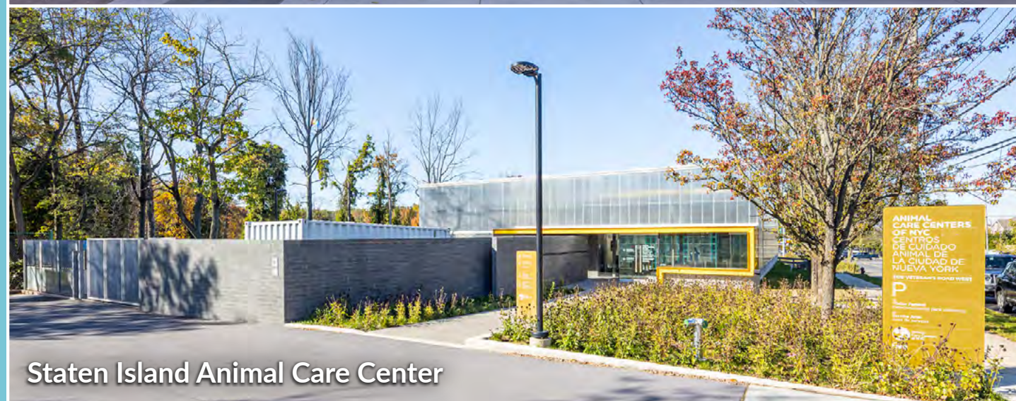
Staten Island Animal Care Center