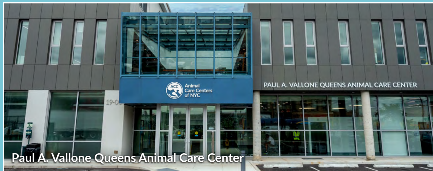
Paul A. Vallone Queens Animal Care Center

(and 2 more currently under construction)