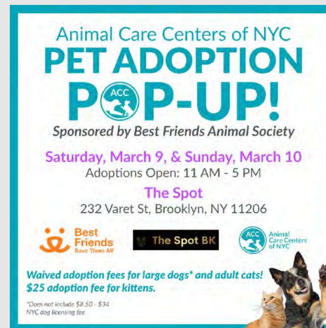
A special thank you to Best Friends Animal Society for hosting multiple pop-up adoption events in 2024!

These partners provide specialized medical care and behavioral attention for animals who may otherwise not be ready or suitable for adoption to the general public. In 2024 ACC welcomed 42 new rescue groups to our existing roster of over 300 New Hope partners.