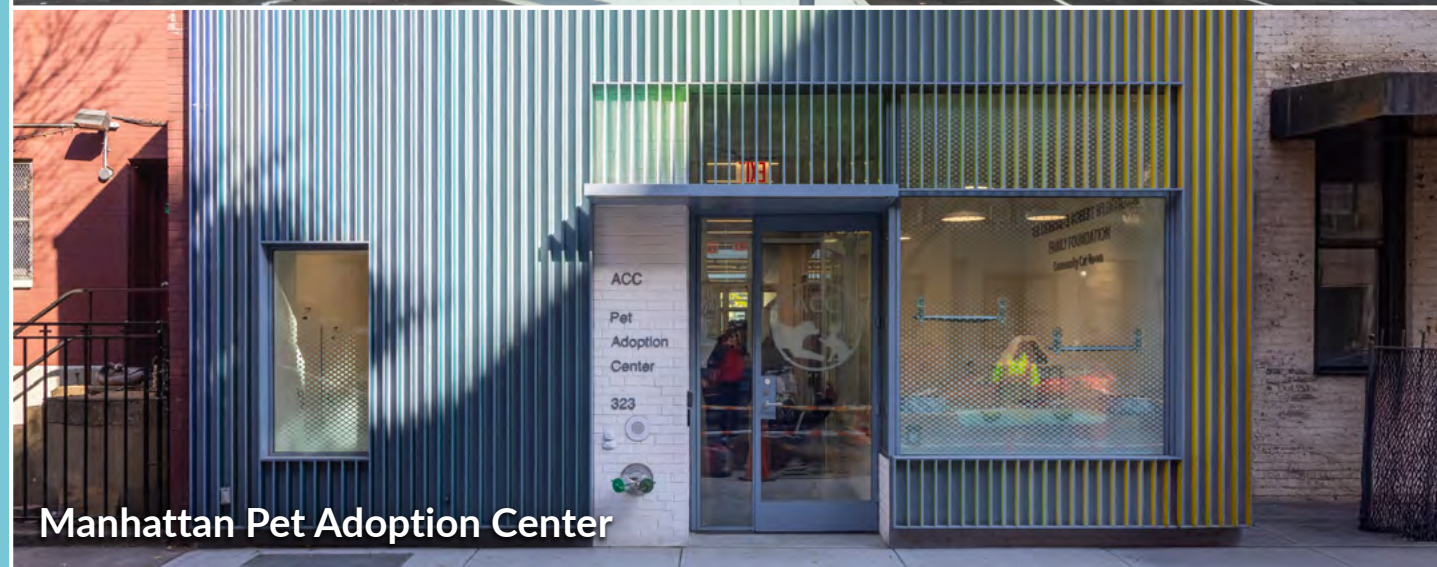
Manhattan Pet Adoption Center