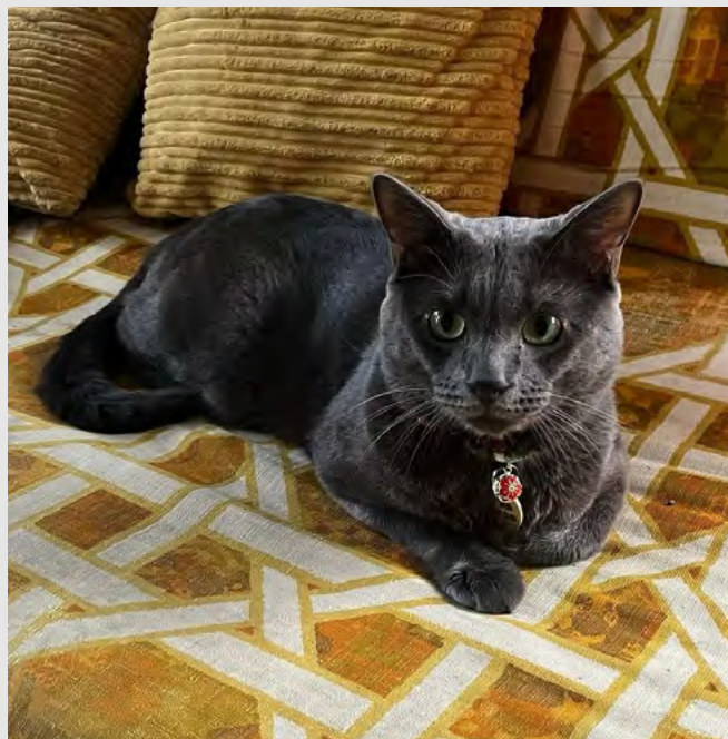
Godzilla, Adopted October 2024 from Queens ACC

In 2024 with the help of a growing number of adopters and New Hope partners we were able to find placement for 91% of the over 15,000 companion animals that came through our doors.